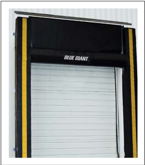
BGDSA Adjustable Head Pad Dock Seal