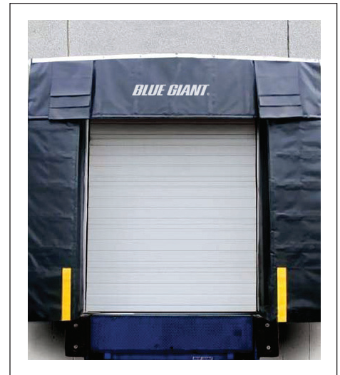
BGDSHF Foam Dock Shelter